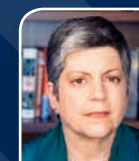
JANET NAPOLITANO President, University of California

► Special Program: Biotech Research Ecosystem: From Lab to Patient