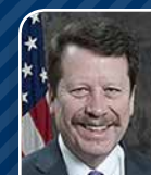
ROB CALIFF Commissioner, United States Food and Drug Administration

► Super Session: Beyond the Cutting Edge: How to Enable Life Science Organizations Today for the Societal Challenges of Tomorrow