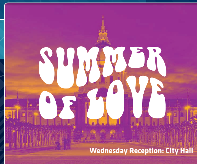
Wednesday Reception: City Hall